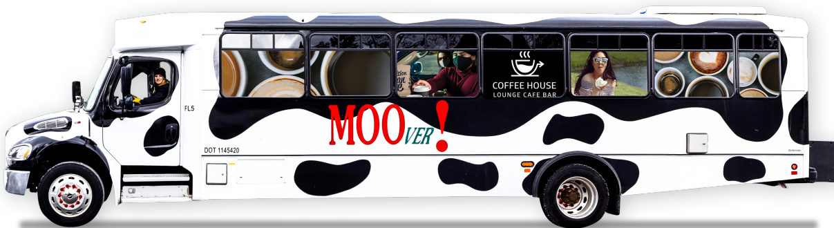
Message can be split on each individual pane of glass