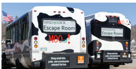
Message on rear window of bus