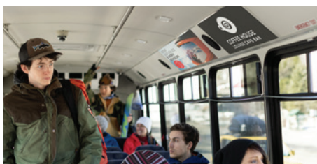
Message on the interior of bus