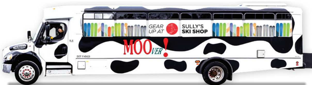
Your message can span the entire width of all windows including the space between the window pane