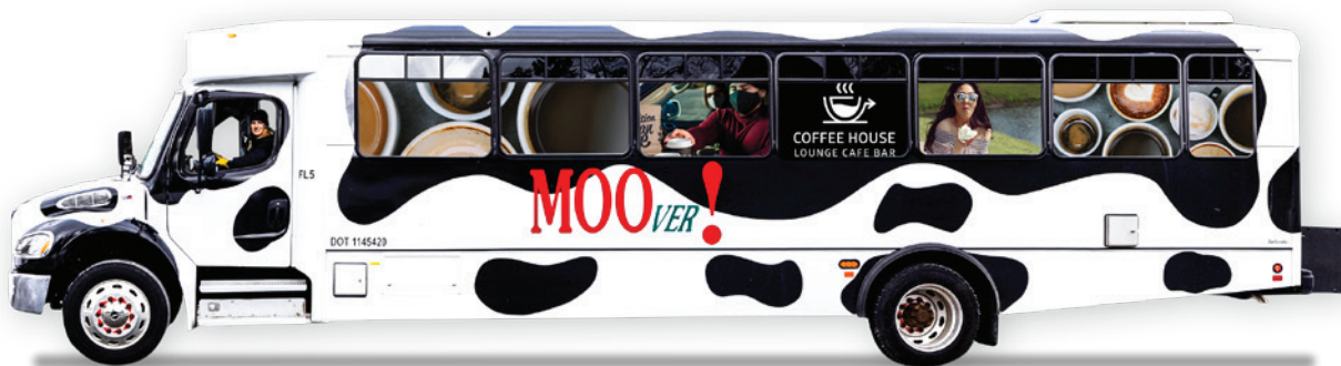
Or your message can be split on each individual pane of glass