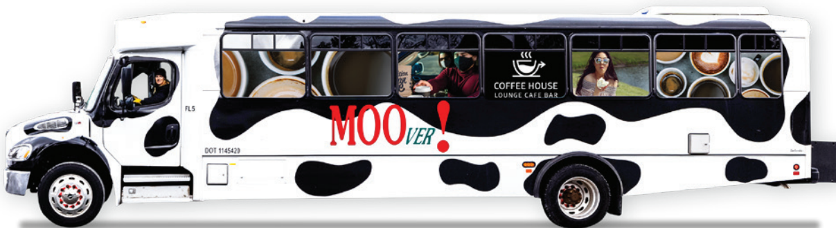
Or your message can be split on each individual pane of glass