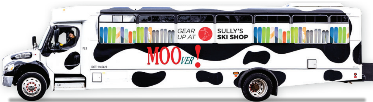
Your message can span the entire width of all windows including the space between the window pane