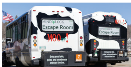
Message on rear window of bus