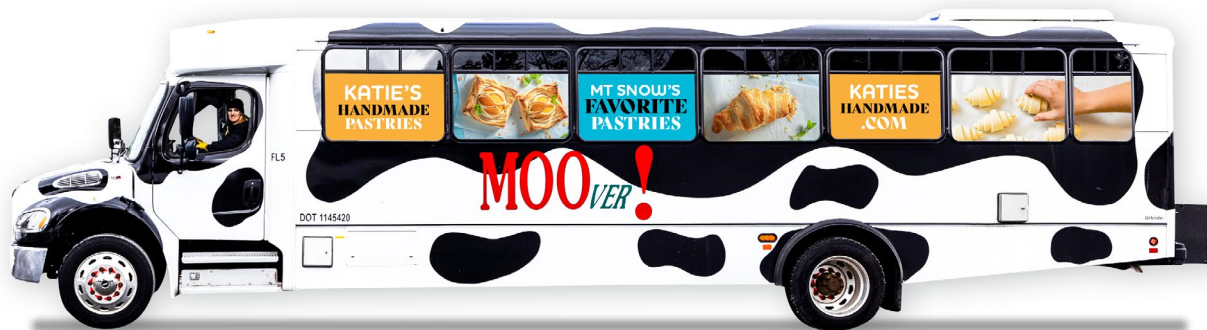
Or your message can be split on each individual pane of glass