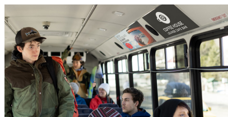
Message on the interior of bus