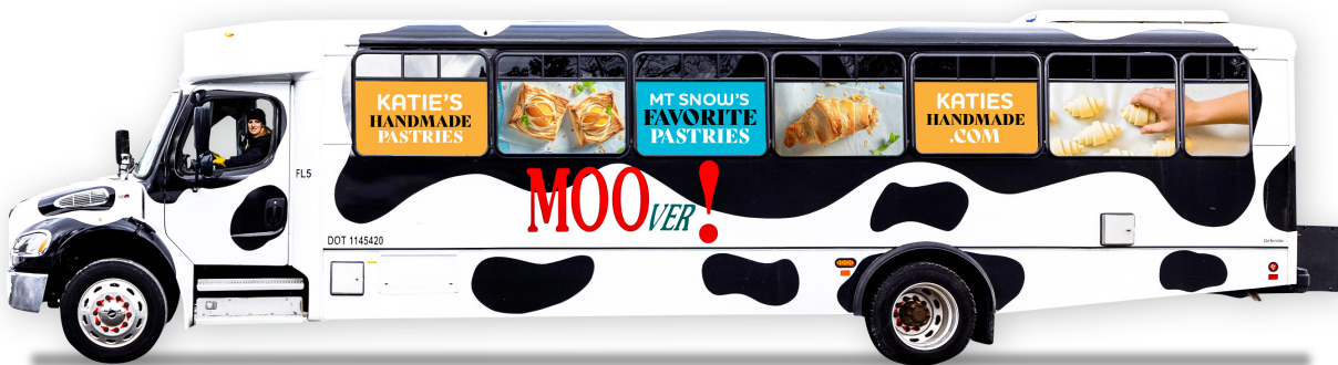
Or your message can be split on each individual pane of glass