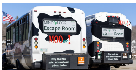
Message on rear window of bus