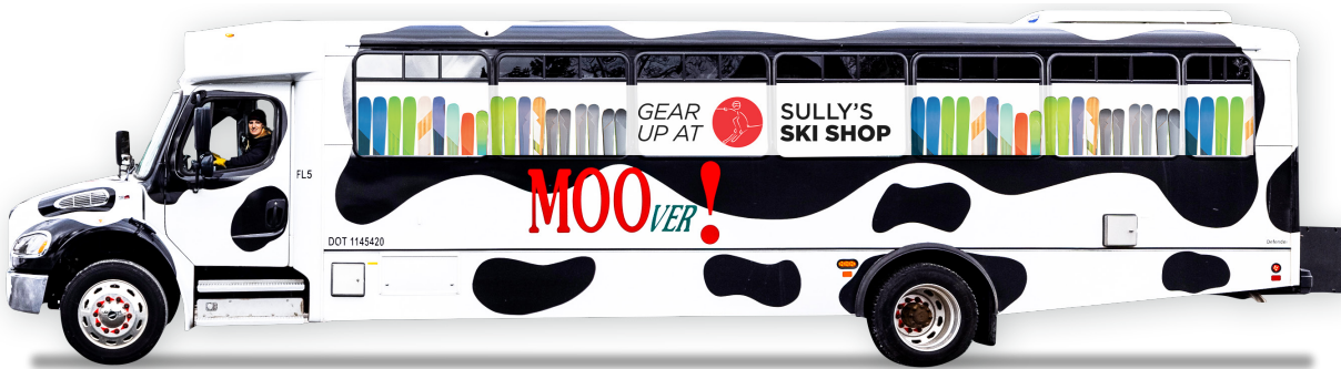
Your message can span the entire width of all windows including the space between the window pane