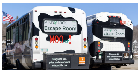
Message on rear window of bus