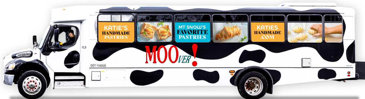
Or your message can be split on each individual pane of glass