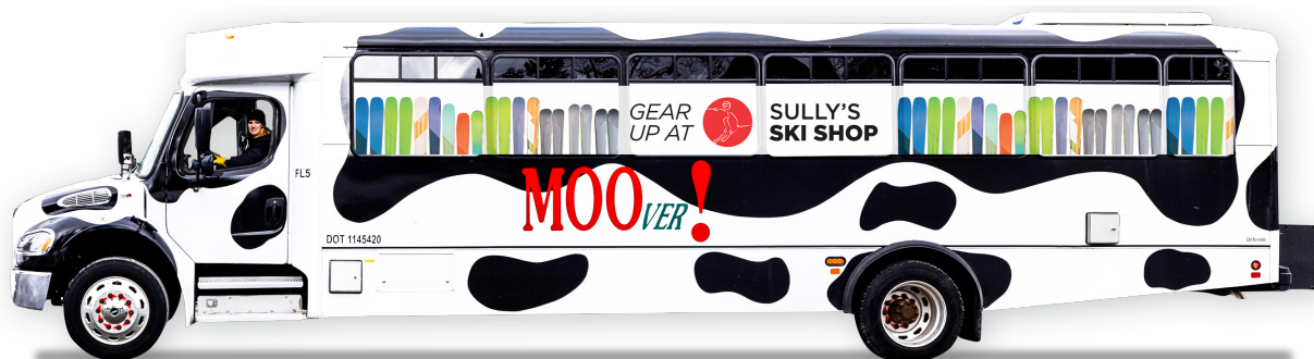
Your message can span the entire width of all windows including the space between the window pane