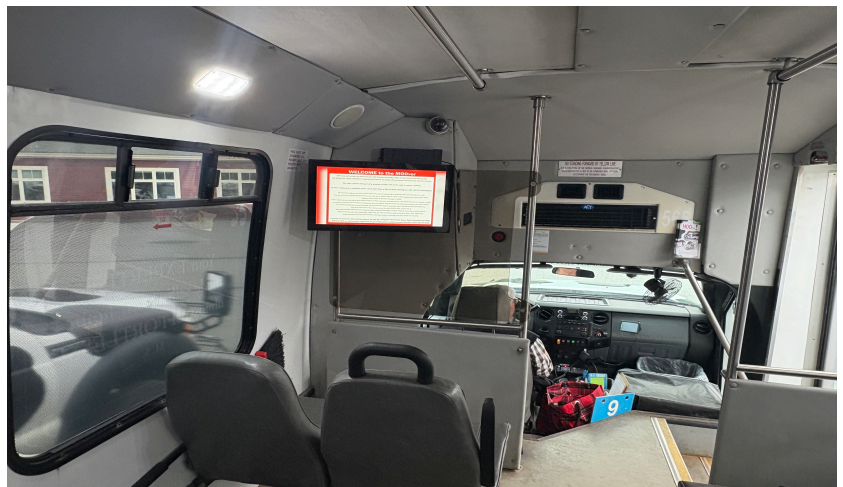
Message on the interior of bus