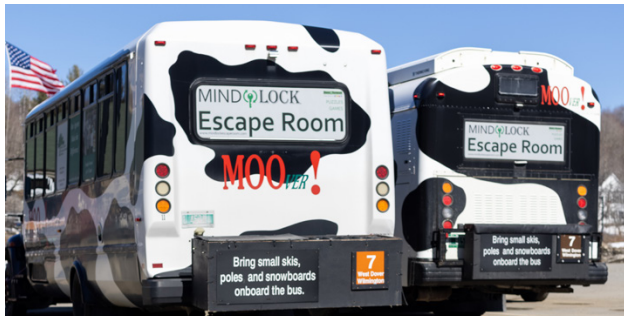
Message on rear window of bus